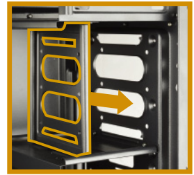
Removable 2.5" SSD bracket to fit longer VGA card