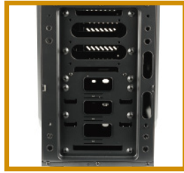
Dual front fan slots for super cooling