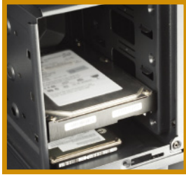
One extra 2.5" SSD space at bottom