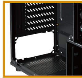
Bottom mounted PSU slot