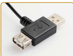
Extending USB port