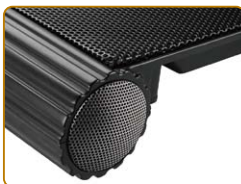
Premium Sound Effect